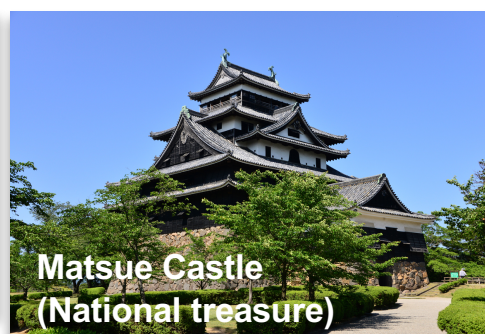
Matsue Castle (National treasure)

The finest Japanese garden chosen by "The New York Times"