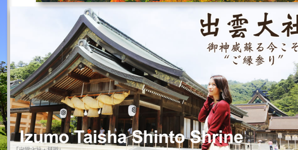
出雲大社 御神威蘇る今こそ "ご縁参り"